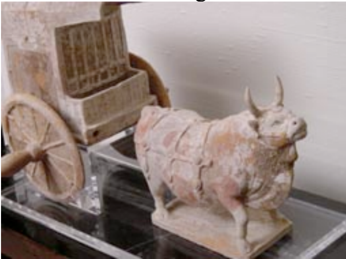
Sculpture of oxcart.

The oxcart was very popular. It may be slow but can carry a big capacity. It can carry big loads of rice and people. The oxcart is pulled by an oxen. It is named the oxcart because of the animal that carries the cart. For example there is a horse carts and a dogcarts.